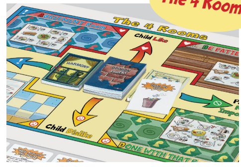
The 4 Rooms