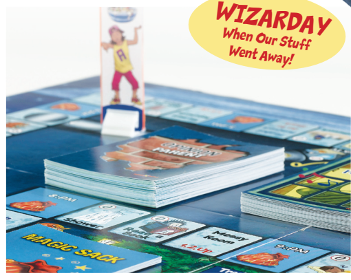
WIZARDAY When Our Stuff Went Away!

Retail price: Book $14.50 Game $25.00 Package (Book + Game) $37.50 For parents and children, ages – 8+.